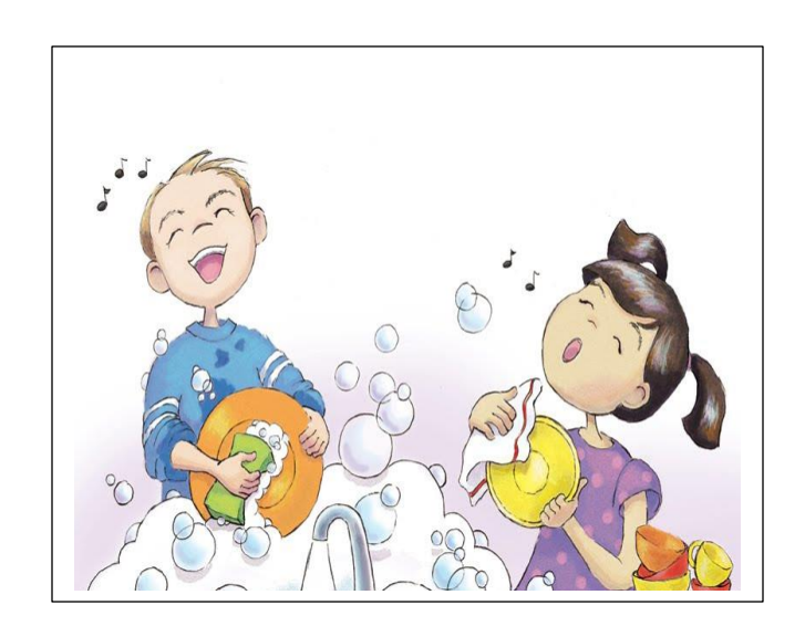
It's fun doing the dishes together!!!